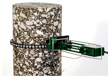
Model 3544 in a horizontal body style

simultaneously with the Model 3542RA axial extensometers.