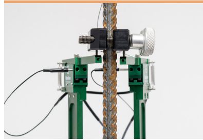
Model 3567 specimen attachment collar with extensometer installed

Extensometers for measuring elongation of rebar coupler, splice, and sleeve assemblies. Use for tension, cyclic, slip, and differential elongation tests.