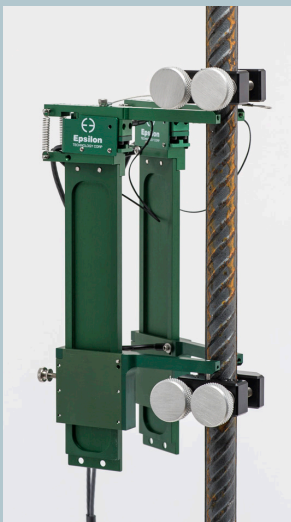
Model 3567 with mounting collars (rebar coupler not shown)