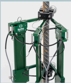
Option for average of three measurements (rebar coupler not shown)

Model 3567 extensometers are strain gaged devices, making them compatible with any electronics designed for strain gaged transducers. Most often they are connected to a test machine controller and Epsilon will equip the extensometer with compatible connectors that are wired to plug directly into the controller. For systems lacking the required electronics, Epsilon can provide a variety of solutions for signal conditioning and connection to data acquisition systems, chart recorders, or other equipment.