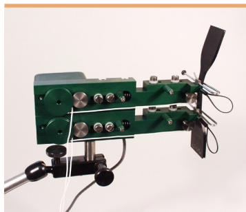
Model 3800 with mounting stand

Designed for plastics, rubber and elastomer testing, these extensometers have very long measuring ranges. Their unique design allows testing to failure and minimizes interaction with the sample.