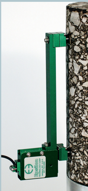
Model 3909-0400 with 4 inch gauge length

See the electronics section of this catalog for available signal conditioners and strain meters.