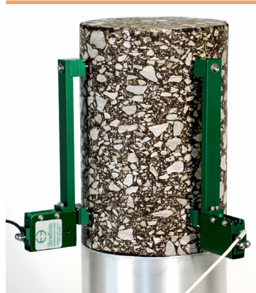
Model 3909-0400 with 4 inch gauge length

Designed for measuring axial displacements in the simple performance tests prescribed by NCHRP Report 465, and determining dynamic modulus of hot mix asphalt per AASHTO TP062.