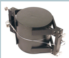
Model 3909 gluing fixture for 180° spacing