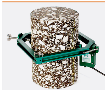
Model 3975 extensometer

Designed for accurate measurement of small diametral strains such as those required to determine Poisson's ratio of rock, concrete and asphalt samples. The units are designed to be used in conjunction with the Model 3542RA axial averaging extensometer.