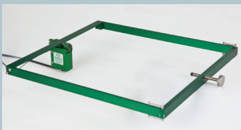
Model 3975 extensometer