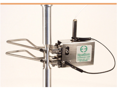
Model 4030 with 0.5 inch gauge length

Submersible extensometer designed for performing tests in water, saline solutions, and other liquids compatible with the materials of construction.