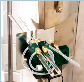
Model 3580 mounted to split furnace

See the electronics section of this catalog for available signal conditioners and strain meters.